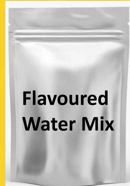
Ready to load Flavoured water Paste Packets with 6 Months Shelf Life at room temperature