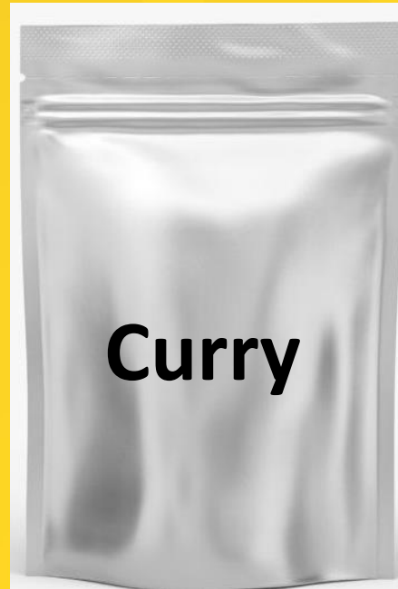
Ready to load Curry Packets with 6 Months Shelf Life at room temperature