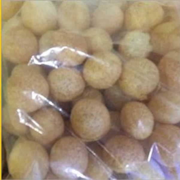
Packaged Puri's Supply